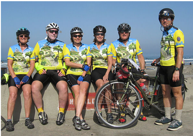
fun to be a kid again..

Please send this form to: Knickerbikers of San Diego County 8590 Cliffridge Avenue La Jolla, CA 92037