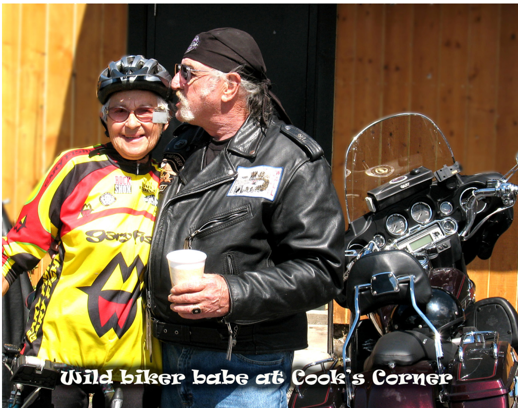
Wild biker babe at Cook's Corner